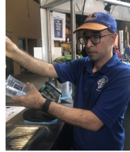
Durham Bulls Wraps up