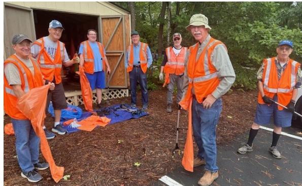
Let's do this!!