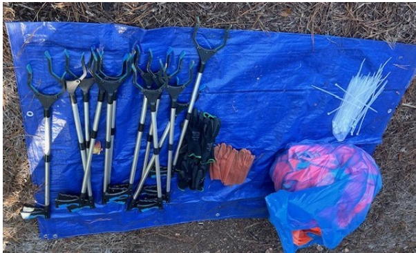
Tools for today's event