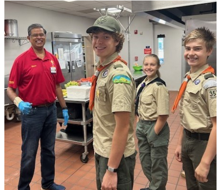
Scouts did an awesome job!