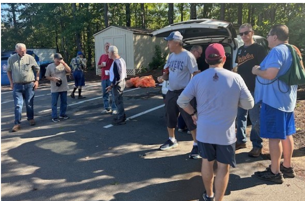
Returning from the mean streets of Raleigh