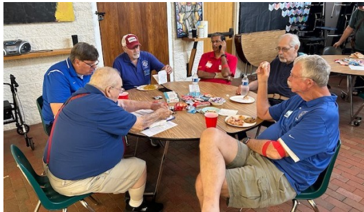
Military precision lining up the next food run!