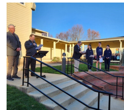
TFS ESSAY CONTEST