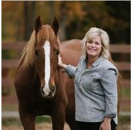
HOPE REINS DONATION