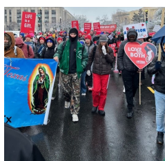
MARCH FOR LIFE