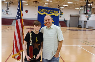
BASKETBALL FREE THROW