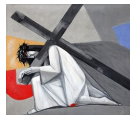
STATIONS OF THE CROSS