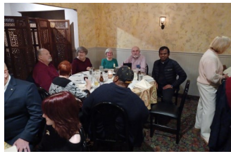
KofC Christmas Party