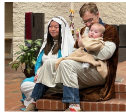
The Living Nativity