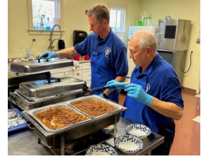
Harvest Moon Fest