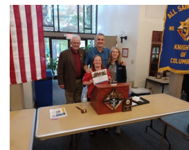
Grand Knights Report