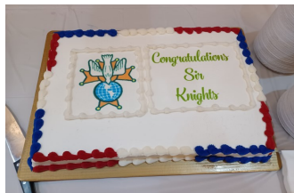
4th Degree Exemplification