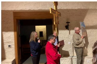
Memorial Day Mass