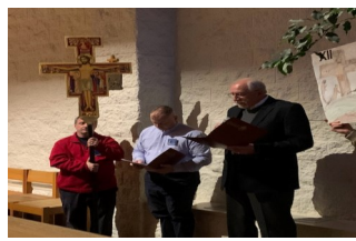
Stations of the Cross