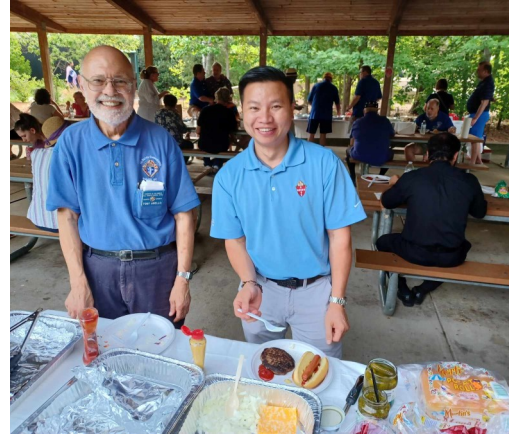
FRATERNAL YEAR-END PICNIC