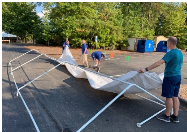
At the end of the day, it all has to come down. Brother Knights pitch in to take down the tents and chairs in the dining tent.