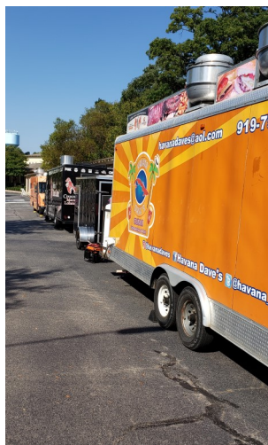
Great selection of food trucks were on scene providing a large variety of tasty foods.