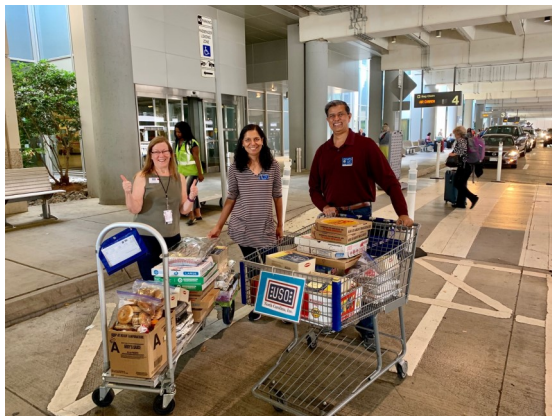
USO benefits from the blood drive leftovers with two full carts of donated leftover food. Our young soldiers will eat well this weekend!