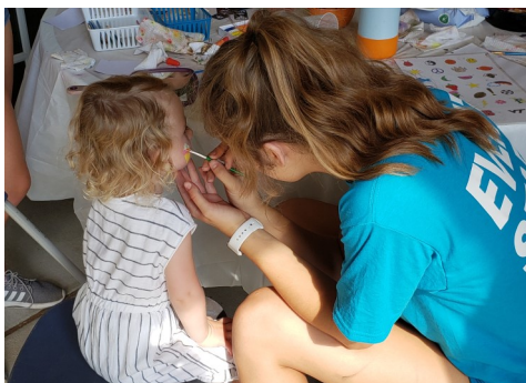
Young artist providing face painting for the youth. Many youth spent the day with color designs on their faces.