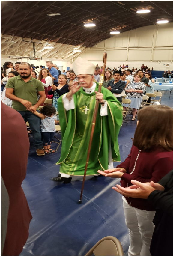
Bishop Zarama performs the Mass for the elevation of St. Bernadette's into the Dioceses of Raleigh. Formerly a mission Church.