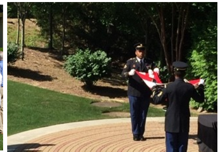
Army Honor Guard folding of the flag ceremony begins with the unfolding of the flag.