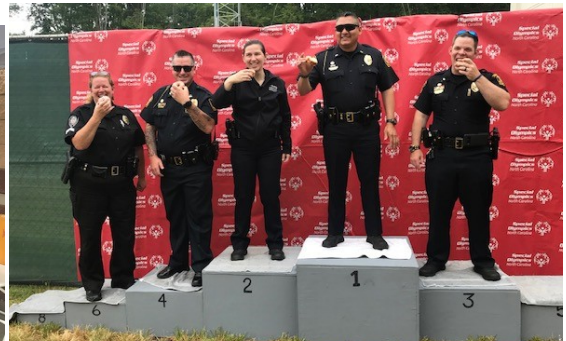
Our very special group of officers were rewarded for the exemplary work with donuts!