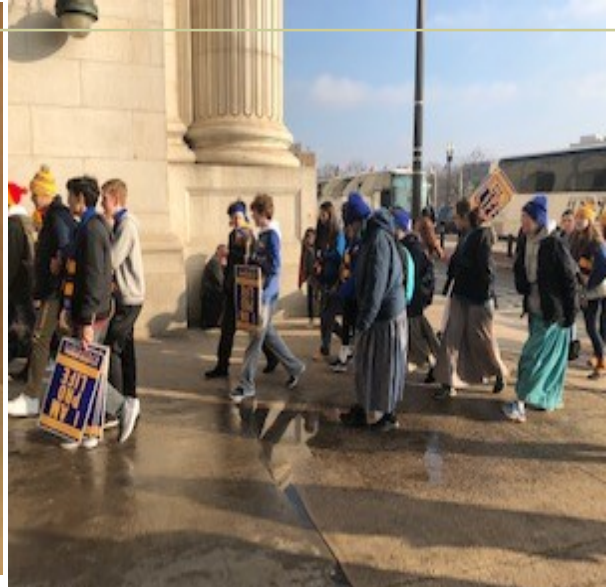
Many Catholics showing their support for this years march by first attending mass prior to the days march.