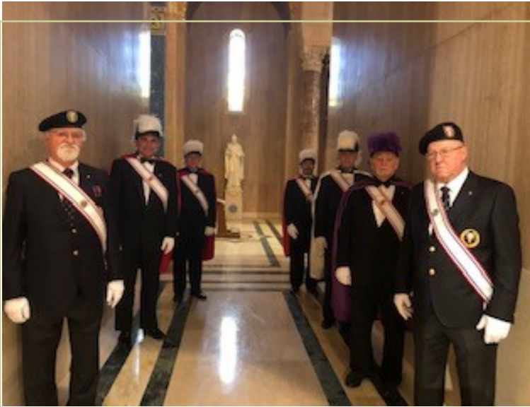
Sir Knights from North Carolina gathered together in their Regalia to provide an Honor Guard for the Bishop at the Holy Name Cathedral in Washington DC prior to the march.