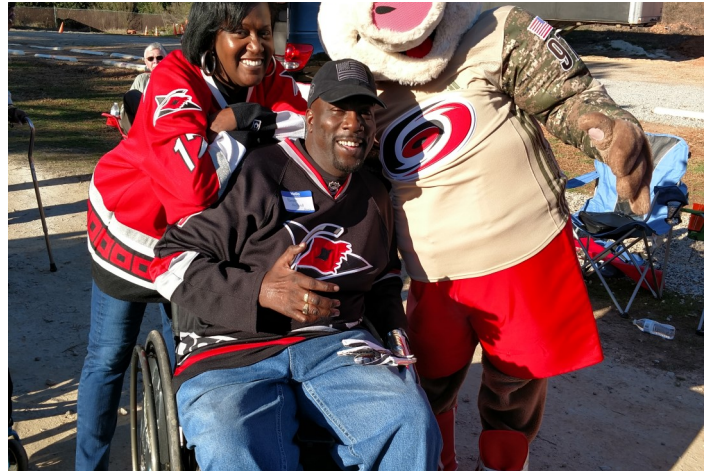
This veteran receives a very special welcome from Stormy at the pregame barbecue provided by the Knights to honor our veterans.

This years Knights at the Hurricanes Game had record attendance, 88 total attendees, particularly including a group from a Winston-Salem Council who plan to return next year with a cook-off of their BBQ chicken vs. our BBQ pork. There were 22 vets from the Durham VA including all branches of service except the Navy. I think there were about 10 kids attending and don't forget Stormy's visit!