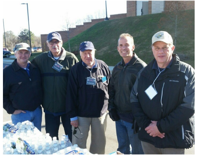
Knights provided assistance with the Love My Life Youth Rally. We helped with handing out food for all Rally Participants'. We also assisted with cleanup and takedown after the event.