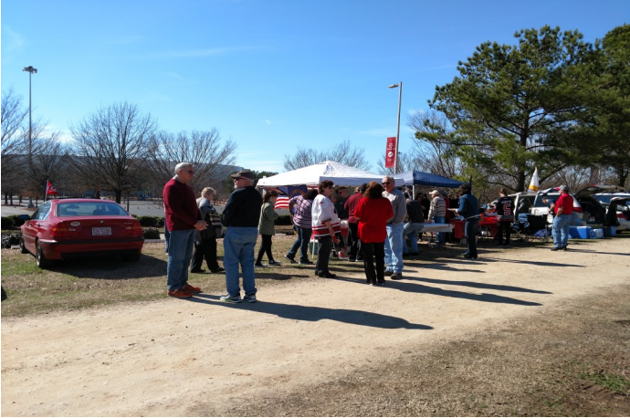
This year Hockey game brought out record attendance with the Hurricanes providing free attendance for our Veterans.