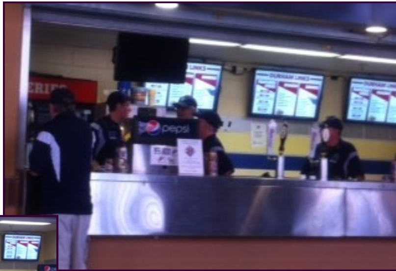
Week 2 Members at booth