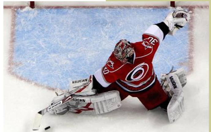
Canes game against the Oilers was played to honor the Veterans of our Armed Service.