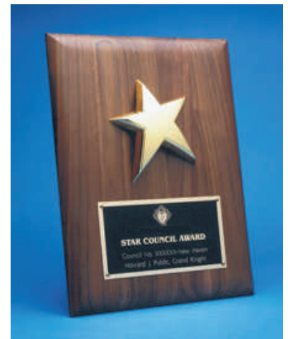
Supreme Star Council Award Plaque

Source: "Shoot for the Stars: The Star Council Award, KofC Publication #4069, 1/10