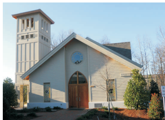
St. Mary of the Angels Chapel

Under Article VIII of the Council's By Laws specify that the Council will hold a Mass in November each year "for the repose of the souls of deceased members." This is the first time, however, that the Council has observed that provision of the By Laws.