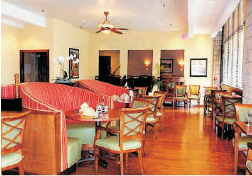
View of the "Valley" area of the Marriott's Crabtree Grill dining room.

Saturday, December 17, 2011 4 p.m. - 9 p.m.