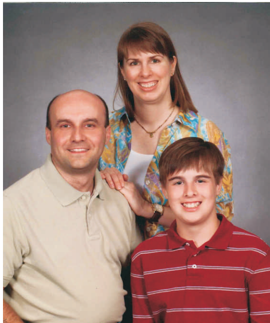
The Monetti Family