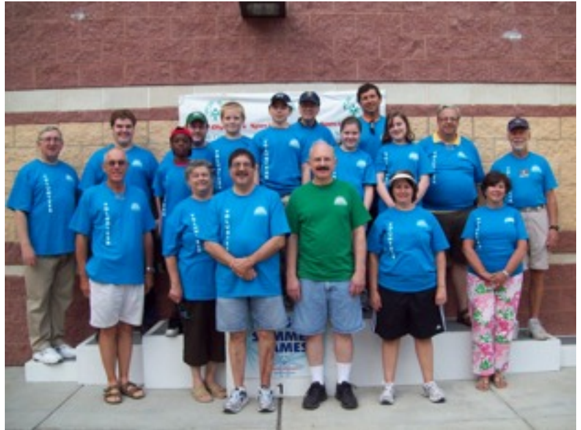
Council 9709 volunteers for Sunday, June 5.

Some 27 Knights, spouses and children presented awards for 278 events at the 2011 Special Olympics North Carolina Swimming Competition at the Triangle Aquatic Center in Cary over the weekend of June 4-5. Eight Boy Scouts and parents from Troop 352 from St. Francis also pitched in on Saturday, June 4. There were also four law enforcement representatives from the North Carolina Torch Run, a Special Olympics fundraiser, on hand Saturday to present awards in the morning. The special presenters were from the Cumberland County Sheriff's Office and the Charlotte-Mecklenburg and Winston-Salem Police Departments. Some 375 athletes were registered to participate in the competition.