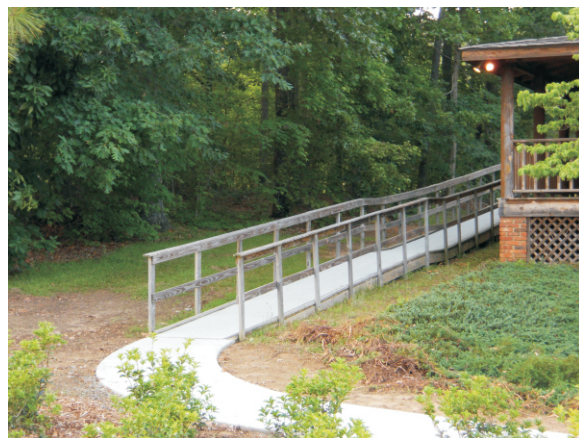
The Laverna House's completed ramp and walkway.

Council members involved in the construction had wondered when the promised cement walkway would be built. Although the connection took almost three years to complete, the ramp looks just as good today as it did when it was first built.