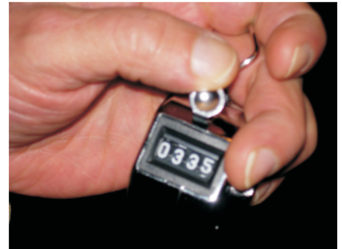
Mass Census counters used this simple push-button device to count parishioners entering the three doors to the Church.