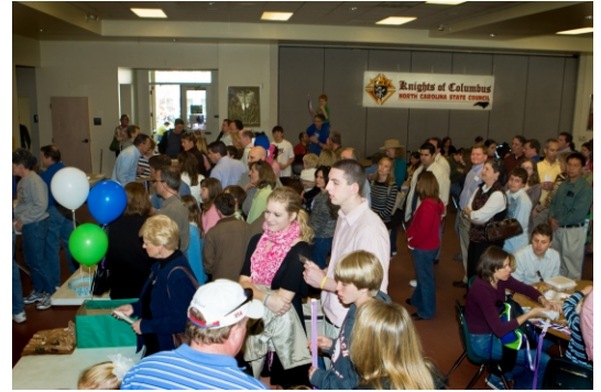
Food service in Jacoba Hall was flawless.