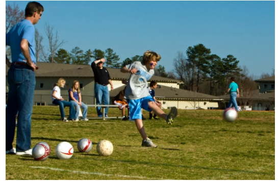
A participant takes a shot.

Each participant had 15 chances to score from the penalty kick area. The goal was divided into five scoring zones. Kicking a ball into the upper corners of the goal counts for 20 points, lower corners 10 points and the center area five points.