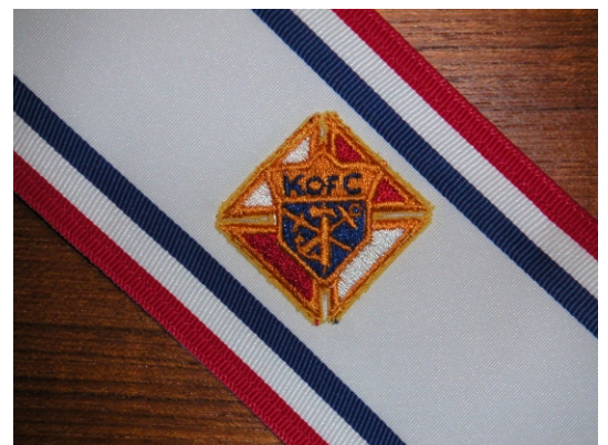
Fourth Degree Baldric

All 4 th Degree Knights wear a baldric, which in the United States and the Philippines has red and blue stripes on a white background, as part of the formal dress. Canada's baldric has red stripes, and Mexico has red and green stripes.