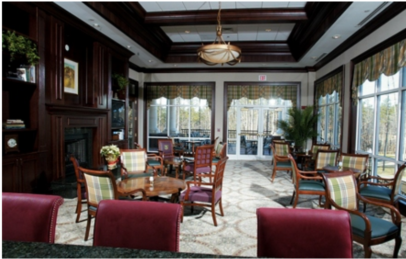
View of the Governor's Lounge, which along with the adjacent Palmer's Cove, will be one of two adjoining rooms used for the Council's 2008 Christmas Party.