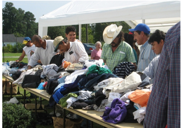
Knights transported linens and clothing to the picnic. What was left over was taken to the camps where the migrants live.