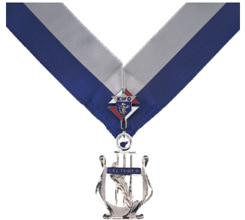
Emblem of a Knights of Columbus Lecturer

Lecturer - The Lecturer is appointed by the Grand Knight to provide both educational and entertaining programs to the Council. He is responsible for the "Good of the Order" portion of Council meetings. In order to provide members with informative and educational programs, he must be knowledgeable and aware of all Council planning.