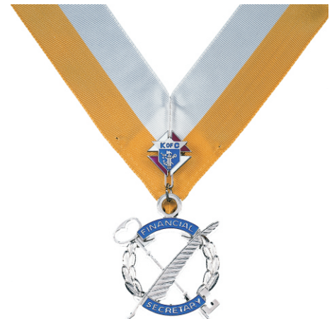
Emblem of a Knights of Columbus Financial Secretary

The Financial Secretary is appointed by the Supreme Knight, upon recommendation of the Council. His main area of responsibility is maintaining all financial and membership records. He collects and receives all monies from all sources, including annual dues from Council members. He also handles supply orders for the Council officers and members, filing the Report of Officer (#185) and submitting all membership transactions to the Supreme Council.