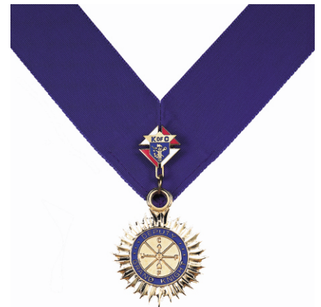
Emblem of a Knights of Columbus Deputy Grand Knight

The Deputy Grand Knight is second in command. He assists the Grand Knight with Council affairs and fulfills all duties assigned to him by the Grand Knight. Should the Grand Knight be absent from a Council meeting, the Deputy Grand Knight will preside. He is Chairman of the Council's Retention Committee and also a member of the Advisory Board charged with overseeing the Council's sponsored Columbian Squires Circle.